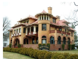
Figure 1. Patsy Clark Mansion

The Management Agreement and design review process ensures the preservation of those historic and architectural features that allowed the structure to be placed on the Spokane Register. A Certificate of Appropriateness is the tool used to provide this protection for a designated structure or district. The Certificate of Appropriateness is an official notice of approval issued by the administrative commission (the Landmarks Commission), or its designee (The Historic Preservation Officer), charged with the jurisdiction for permitting or denying the appropriateness of proposed alterations or additions.