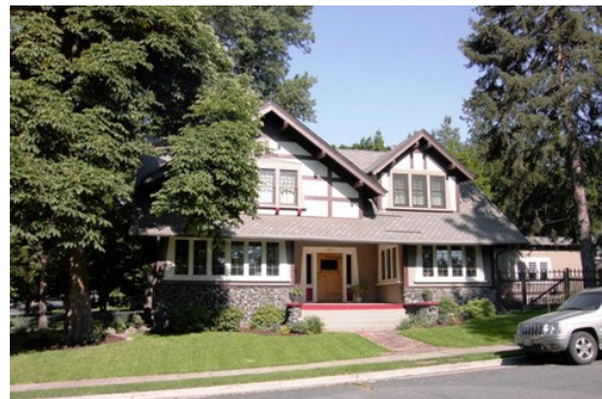
Figure 3. Pattullo House in Booge's Addition Historic District