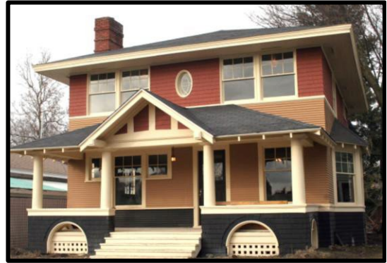
Julius M. Dutton House

The Spokane Register of Historic Places is our local government's official list of those properties that have contributed to the community's history. The Register was established by ordinance in both the City and County of Spokane in late 1981 and early 1982. These ordinances deem the City-County Historic Landmarks Commission responsible for the stewardship of historic and architecturally significant properties. Nominations to the Spokane Register must be accompanied by owner consent, or in the case of a district, the majority of the owners' consent.