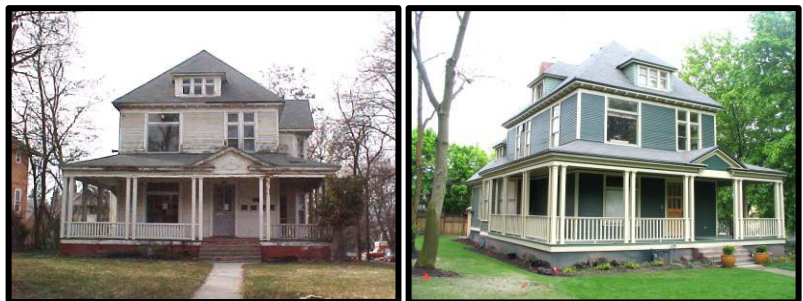
Thomas J. Graham House before and after rehabilitation.

In 1985, the Washington State Legislature determined that the preservation of the state's historic resources was an important goal and allowed "special valuation" for certain historic properties within the state. Under the program, rehabilitation costs, which must equal to at least 25% of