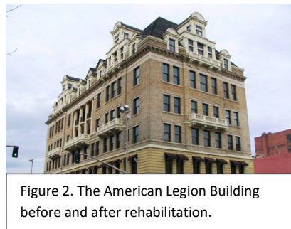
Figure 2. The American Legion Building before and after rehabilitation.

To learn more about the Design Review process and required documentation to be submitted with the Certificate of Appropriateness, visit the Historic Preservation Office website .