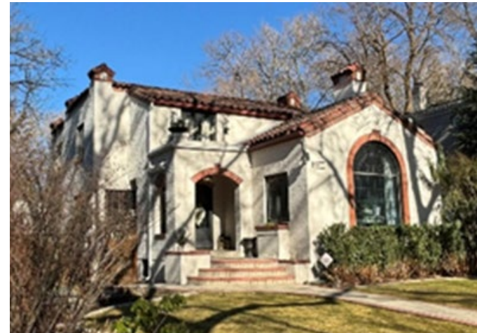
Figure 6: This Mission-Revival cottage with stucco walls has a complex gabled roofline clad with clay tile. 606 W 20th Avenue