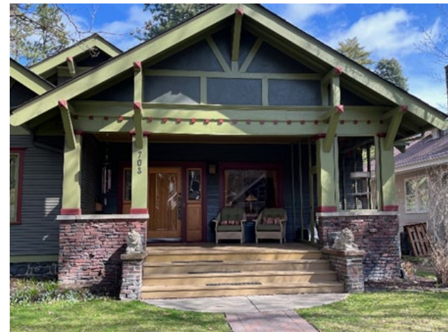
Figure 8: This bungalow porch has brick knee walls framing steps and serving as closed balustrade walls. Square wood posts support a lintel with a decorative dentil course. Brackets support the overhanging eaves of the porch roof. The wide door flanked by narrow windows is the entrance.