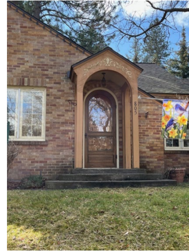
Figure 10: A portion of the concrete stoop of this brick English cottage is sheltered by a gable-roofed exterior vestibule. The arch of the door is echoed in the arch of the vestibule form. W 21st Ave