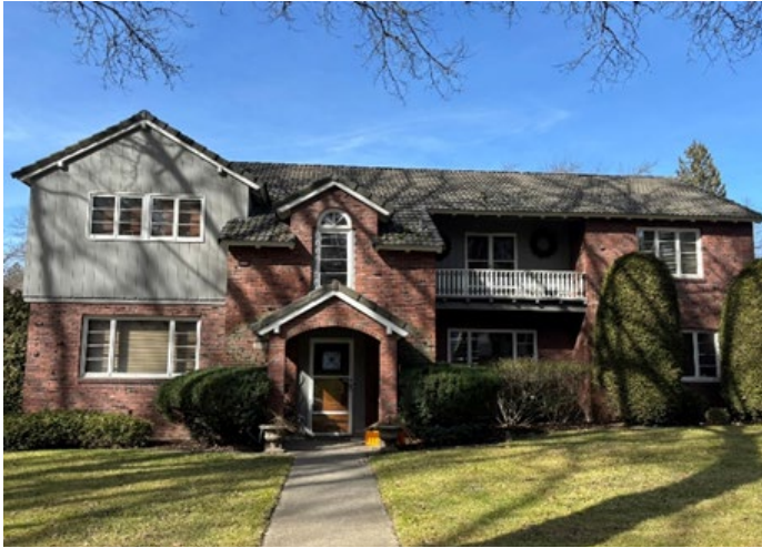
Figure 16: Window sash in this 1949 residence includes a picture window flanked by casement sash with horizontal muntins, sash that appears in a bank of four windows above. Oneida Place