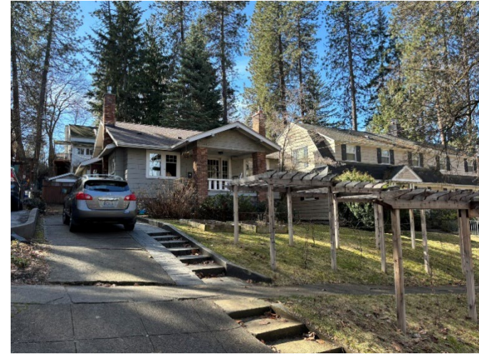
Figure 18: This property's landscaping includes a series of arbor structures; choices like this are acceptable in the residential landscaping. W 21st Avenue