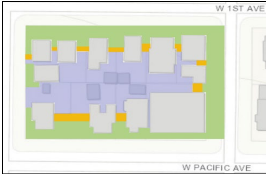
Figure 1: Levels of Visibility

KEY: Highly Visible Minimally Visible Private