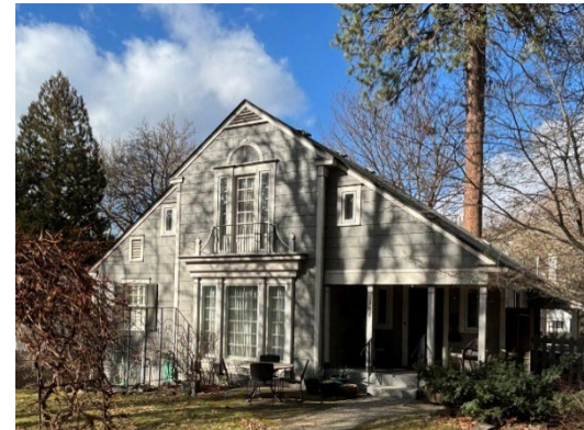
Figure 17: The fenestration of this façade features grouped windows with an elaborate surround below a view balcony with a door flanked with sidelights. W 21st Ave