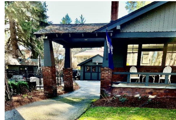
Figure 12: A roofed section of the driveway – a porte cochere – completes the entrance components of this bungalow. Stairs to the porch rise from the driveway as well as the front walk. Shoshone Place