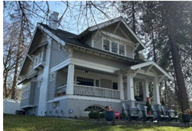
Figure 7: This English/Craftsman residence has several gabled roofs, including a roof dormer and porch steps roof, with angled brackets at the wide eaves. 2015 S. Oneida Place