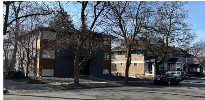
Figure 21: This is multi-family building near on lower South Hill is set back and has a volume similar to the neighboring older multi-family buildings.

For more information on these design strategies, see: