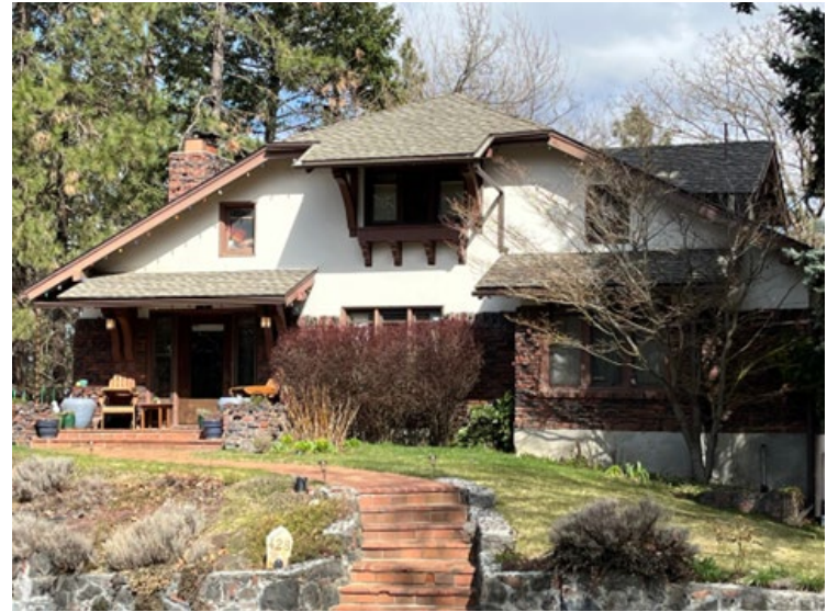
Figure 4: This bungalow has rough-textured clinker brick on the first story and stucco walls on the second.