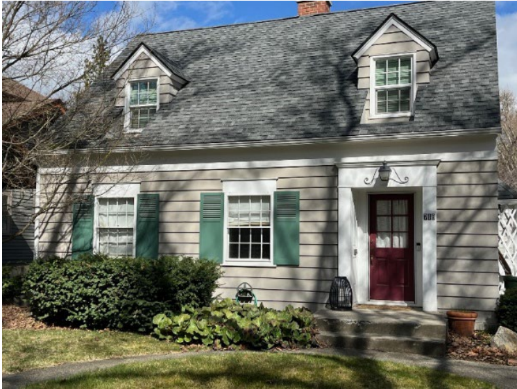
Figure 11: This Colonial Revival cottage has an entrance surround and inset front door approached by a two-step stoop. W 21st Ave