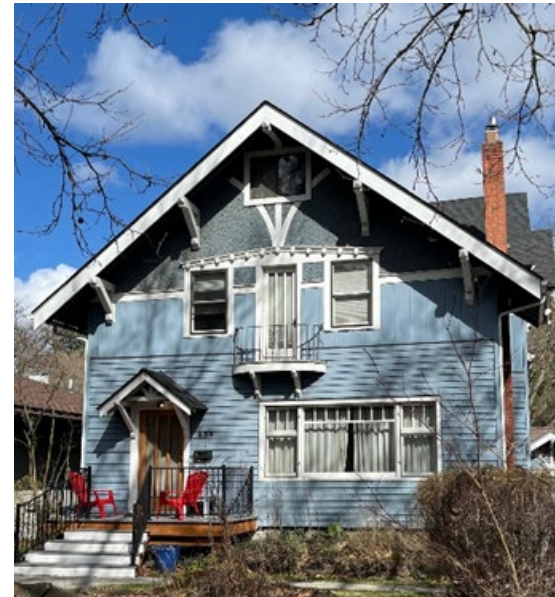
Figure 2: This residence displays three exterior materials above a stone foundation: lapped siding on the first story, board-and-batten siding on the second story, and half timbering at the attic level. 634 W 21st Avenue