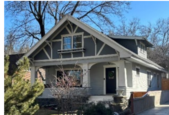
Figure 3: This bungalow displays half-timbering on the gable face and cedar-shingles on the dormer walls. 703 W 20th Avenue

Refer to Preservation Brief 2: Repointing Mortar Joints in Historic Masonry Buildings for technical guidance