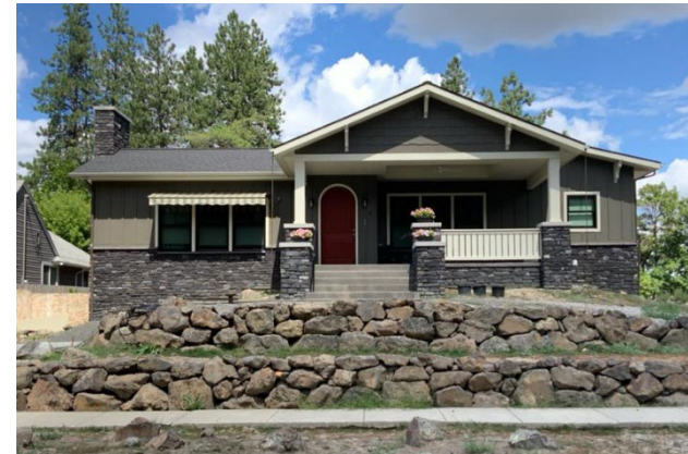
Figure 20: The house at 4 W 18th Ave built 2023 with traditional residential forms and materials. The setback matches the existing homes.