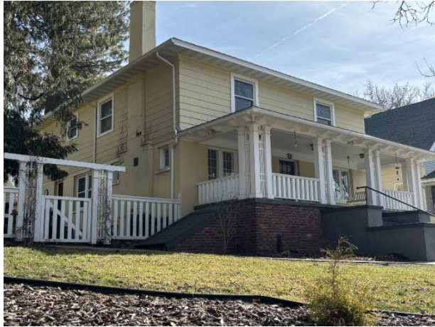
Figure 19: New side yard fencing was placed to extend from the façade of the house and keep the front yard unfenced. Oneida Place