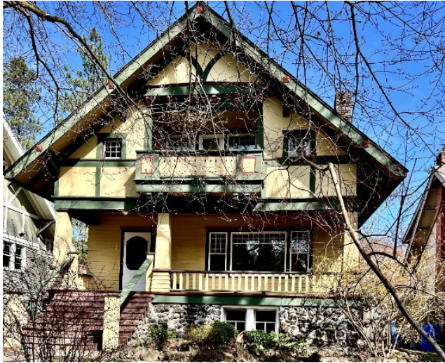
Figure 13: "View balconies" at the second-story levels of English/Craftsman residences and bungalows are another type of porch-like element in the district. Usually shallow, and perhaps recessed as this one is, these features had a balustrade and were accessed by doors from the interior. W 20 th Avenue