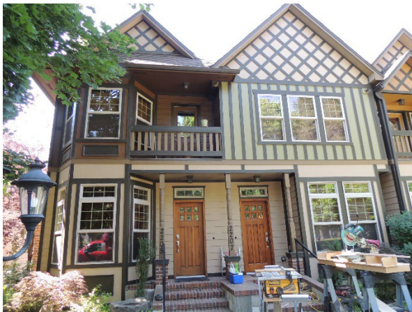
Figure 22: The condominium townhouse development in Browne's Addition could be considered “Invention within” – the buildings match other nearby structures in scale and massing.

An example is a porch on a new building that had a slightly different form than was common historically with modern posts and railing designs. Another type of reinvention would be to use the massing of a large single-family home for a duplex or triplex and reinvent porch and entrance locations and detailing to indicate the number of units within.