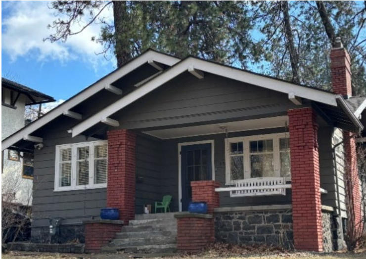
Figure 5: This bungalow is clad with cedar shingles above a cut-stone foundation. 457 Shoshone Place