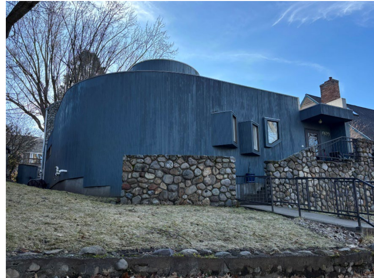
Figure 20: The house at 1909 S Stevens Street was constructed in 1985 and is considered to be non-contributing due to its construction outside of the Period of Significance.