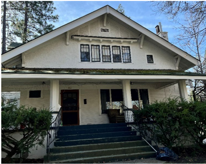
Figure 9: This full-façade porch has full-height octagonal columns supporting its shed roof. Brackets at the eaves and a shallow shed-roof to deflect rain from the upper level windows with original sash.