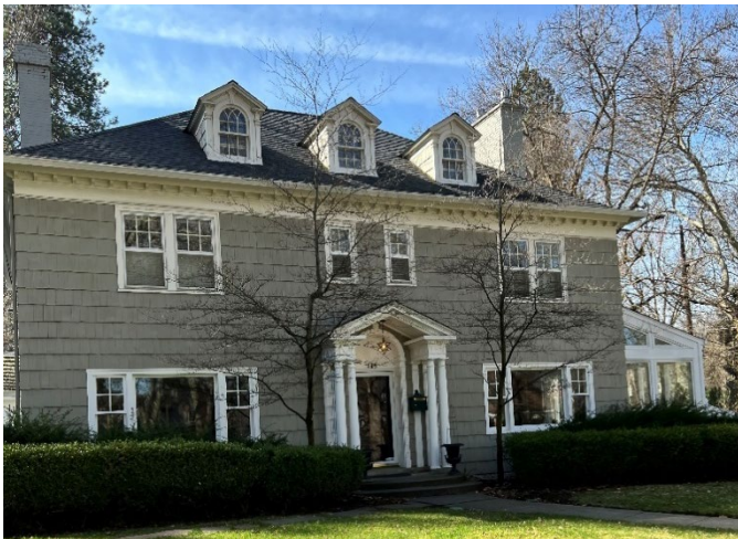
Figure 14: The historic windows with grouped windows separated by mullions and small panes defined by narrow muntins further the Colonial-Revival style of this residence. Dormers have arched window heads and curved muntins. Shoshone Place