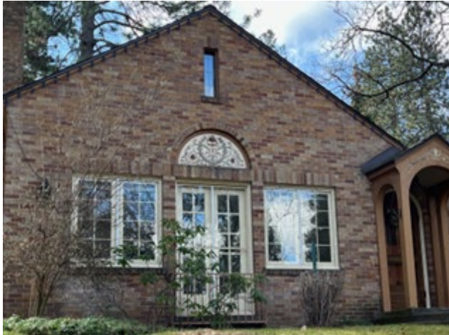
Figure 15: Historic French doors and multi-pane casement windows are fitted with storm sash. W 21st Ave