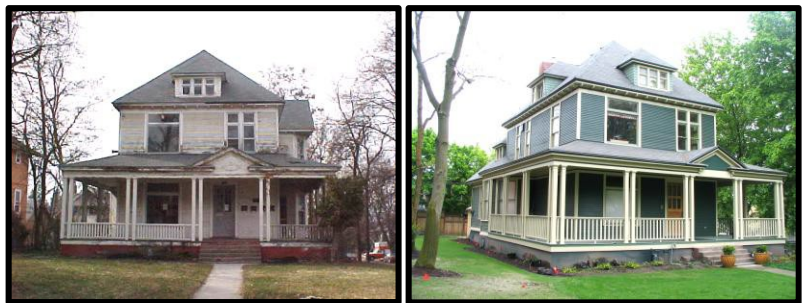
Thomas J. Graham House before and after rehabilitation.

In 1985, the Washington State Legislature determined that the preservation of the state's historic resources was an important goal and allowed "special valuation" for certain historic properties within the state. Under the program, rehabilitation costs, which must equal to at least 25% of