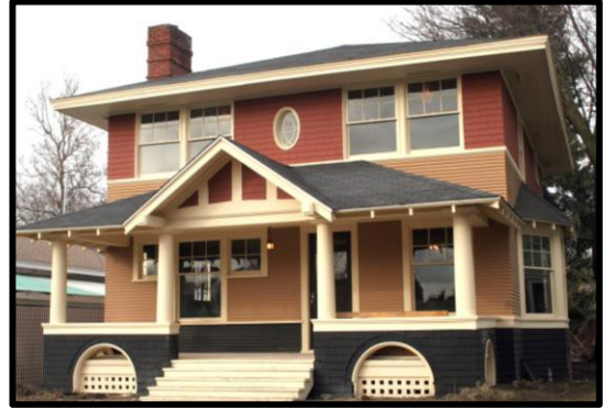
Julius M. Dutton House

The Spokane Register of Historic Places is our local government's official list of those properties that have contributed to the community's history. The Register was established by ordinance in both the City and County of Spokane in late 1981 and early 1982. These ordinances deem the City-County Historic Landmarks Commission responsible for the stewardship of historic and architecturally significant properties. Nominations to the Spokane Register must be accompanied by owner consent, or in the case of a district, the majority of the owners' consent.