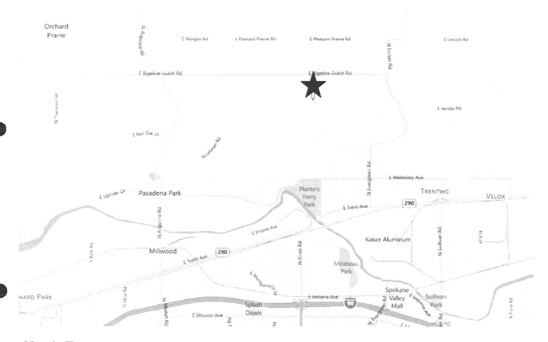
Koch Farm 12426 E. Bigelow Gulch Rd. Spokane, WA 99217