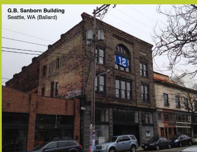
G.B. Sanborn Building Seattle, WA (Ballard)

For enabling legislation, see RCW 84.26 and administrative rules WAC 254-20 and WAC 458-15