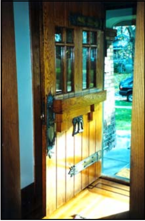
Front door of the Frank & Maude Tuell House, listed on the National & Spokane Registers

In many ways, Spokane's historic and archaeological resources are similar to our rich natural resources. Like wetlands, forests, agricultural lands and other natural resources, historic property are a finite and endangered resource. Also like our natural resources, once an historic or archaeological property is destroyed, it is lost forever. Cultural resources such as historic buildings, monuments of historic events and archaeological sites are statements of Spokane County's identity. People especially value our authentic, homegrown cultural resources that set us apart from other counties.